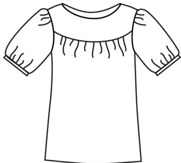
View B - Gathered - Front Back is Gathered (Same)

This pattern and all instructions is copyrighted 2010 by Brensan Studios and The Brensan Group, LLC.