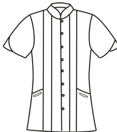
Front - View B