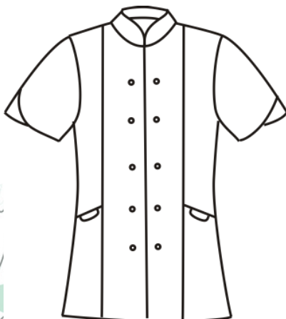
Front - ViewA

Stitch-n-Tear Paper (for stitching Pocket Opening)