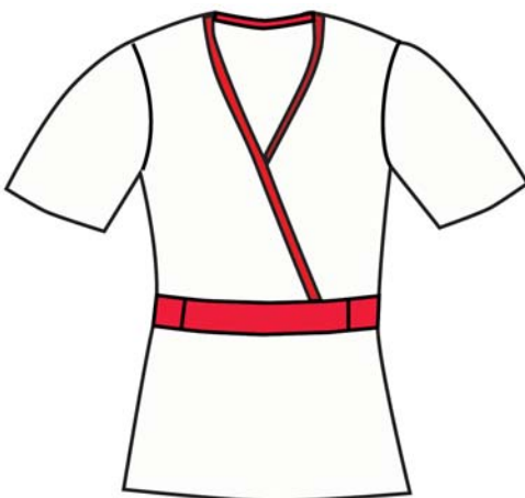
Front - View A