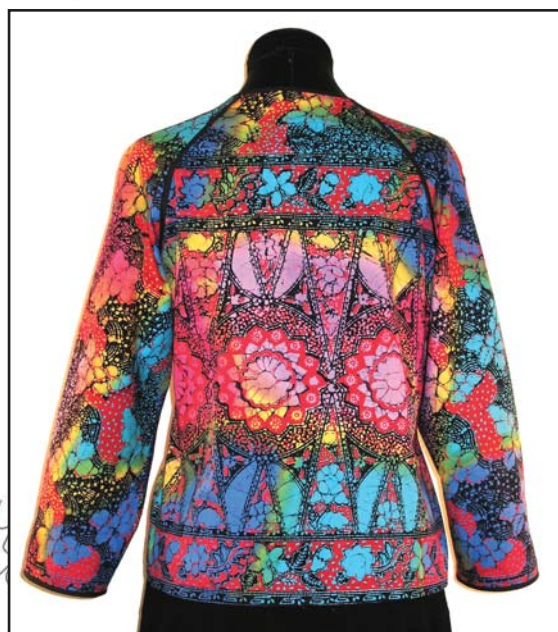
Back View of Border (Single) Fabric

This pattern and all instructions is copyrighted 2006-2009 by Brensan Studios and The Brensan Group, LLC.